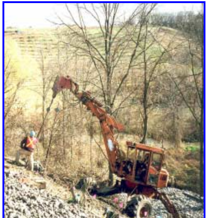
Soil nail stabilization near St. Catherines, Ontario.

The system is patented by DST Consulting Engineers who developed this solution in 1999 for railway track on steep slopes. The solution avoided the environmental impacts of slope flattening, the high cost of retaining walls and the disruption of traffic. New engineering methods were developed with full scale tests. Since then several slopes have been successfully stabilized and the technology is now being applied to riverbank stabilization.