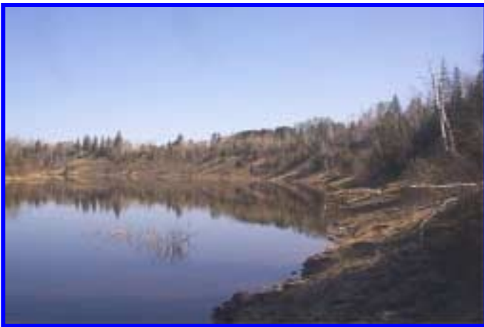
The Kaministiquia River in Thunder Bay, Ontario

The LRCA is responsible for a 30 m high slope subject to landslides in Thunder Bay along the Kaministiquia River. Over the past 25 years, DST Consulting Engineers has developed an innovative cost effective approach to hazard management for 1.5 km of riverbank where homes and infrastructure are at risk.