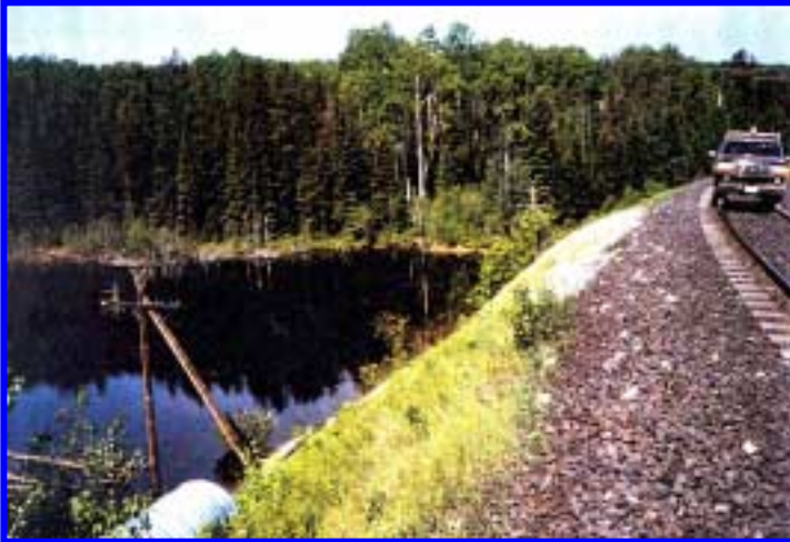
Soil nail stabilization for CN Rail near Hornpayne, Ontario.